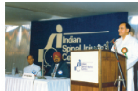
Rajiv Gandhi (Former late Prime Minister of India) Laid the Foundation Stone of ISIC

Hospital. It was an experience that totally transformed him. He realized that though he himself had been lucky to get expert care, millions of Indians were not so fortunate and were forced to lead marginalized lives. It became his life's mission to help others like him and he determined to set up a similar hospital in India.