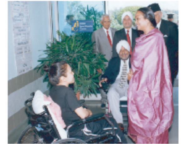
Mrs. Meira Kumari - Hon'ble Minister of Social Justice and Empowerment, Govt. of India, visiting the hospital.

The Indian Spinal Injuries Centre has been set up in collaboration with the Government of Italy, through << San Raffaele Hospital, Milan , along with support from the Government of India. Today it is a model institution comparable to the best in the world. A 145-bed hospital, it has 14 beds reserved for poor patients, many of whom cannot afford to pay. No one is turned away due to lack of funds and there is no discrimination in the quality of medical care. With the latest state-of-the-art diagnostics and surgical equipment and a highly qualified team of doctors, surgeons, physiotherapists, who have all been trained at the world's best institutions, ISIC has become a major referral centre. Its patients come not only from across India, but from all over the world.