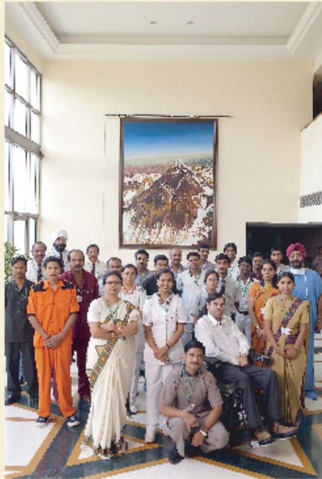
Our Staff...Our Strength...