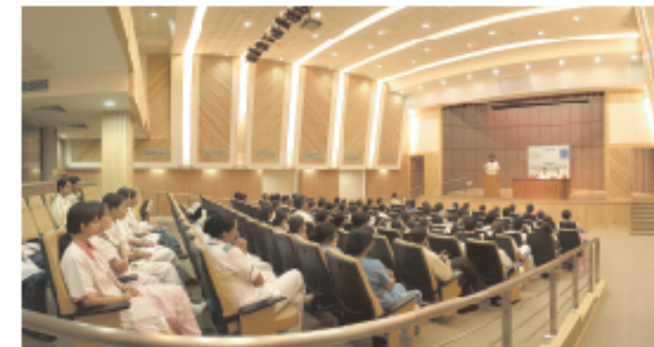
Auditorium with sophisticated sound & projection facilities

The driving force behind the revolution in spinal injury management in India, ISIC has taken the lead in organizing international seminars and conferences and provide a forum for the exchange of knowledge, new ideas and research findings in disability care. It recently hosted the International Spine & Spinal Injuries Conference on "Complications in Spinal Cord Injury & Spine Surgery", under the patronage of the International Spinal Cord Society.