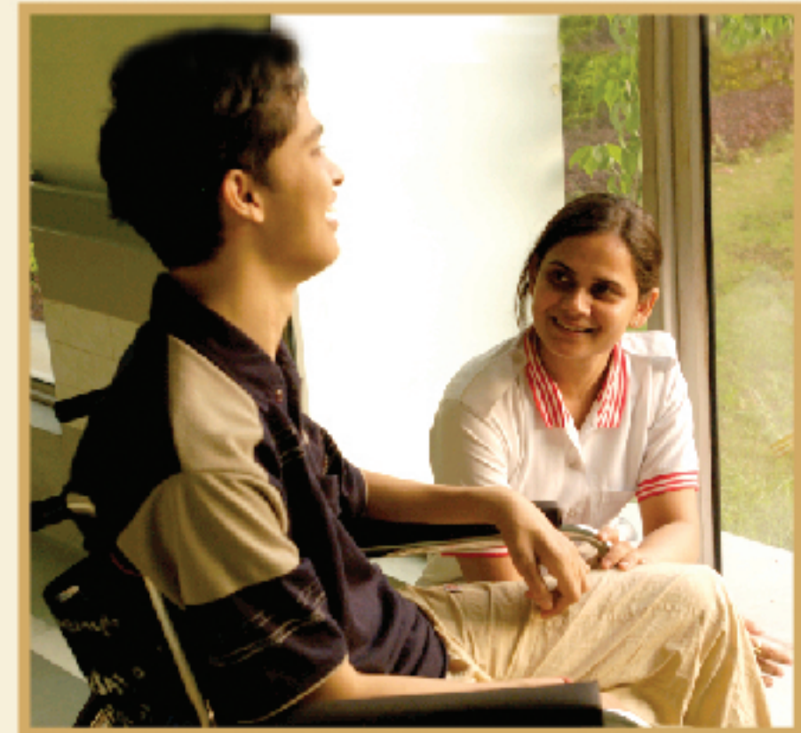
Healing through Hope & Joy