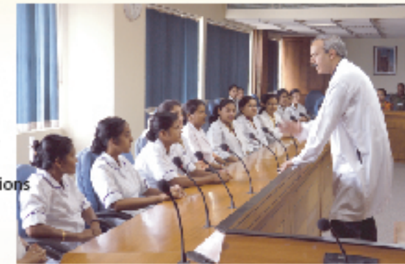
Education of the highest standard