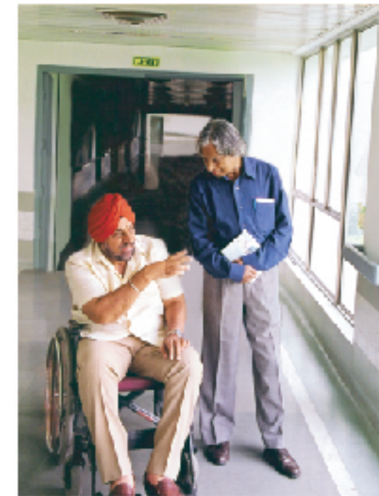
Dr. A.P.J. Abdul Kalam President of India visiting ISIC

US $ 10 million in the project - the largest ever Italian collaboration with any country in this sector. The Indian Spinal Injuries Centre (ISIC) was a true landmark, not only in India, but in the whole of Asia.