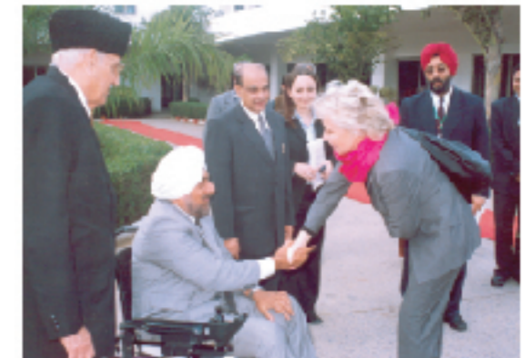
Mrs. Margherita Boniver - Hon'ble Minister of State, Foreign Affairs, Govt. of Italy, visiting the hospital.

It is also probably the only hospital in the world designed by a patient. Major Ahluwalia was able to use his own experience to provide the architects unique insights into the problems faced by patients and help to find optimum solutions. It is the only hospital in India that is totally barrier-free and has the unique advantage of providing everything that a patient would need under one roof.